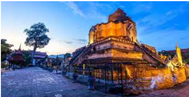
Chedi Luang Temple