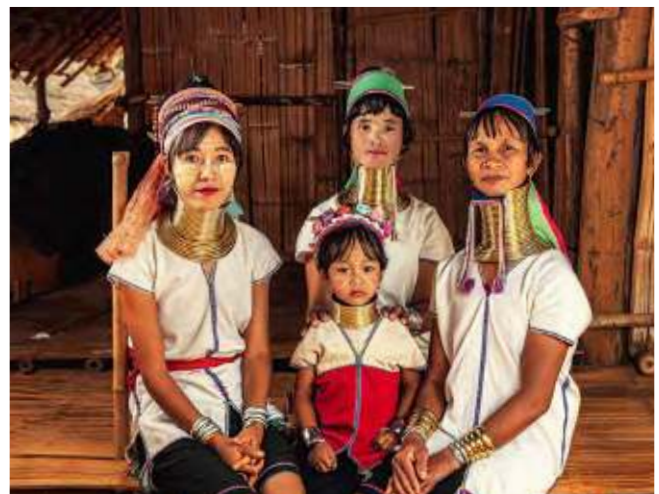
Long Neck Villages