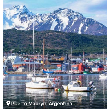
Puerto Madryn, Argentina