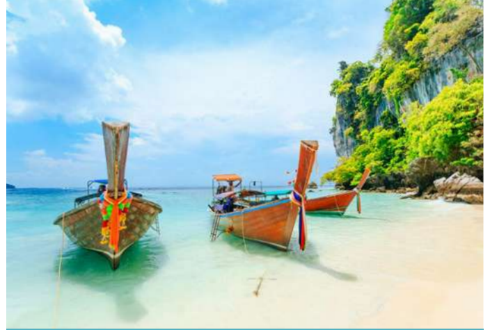
Koh Phi Phi