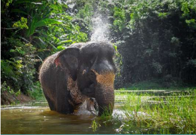
Phuket Elephant Sanctuary

FROM MYR 3,018 per person on twin-share (NP: FROM MYR 3,552)