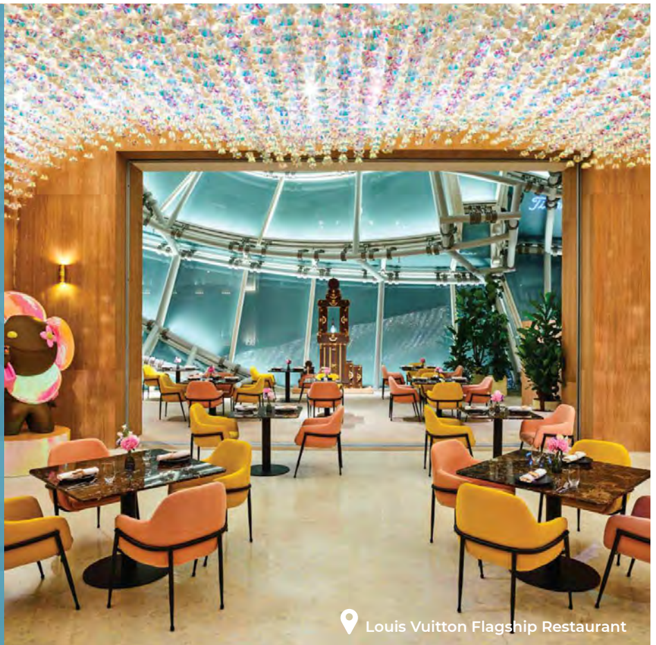
📍 Louis Vuitton Flagship Restaurant

Travel from 1 Nov 2022 till 30 Jun 2023 • Book from now till 12 Dec 2022